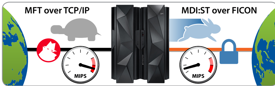
MDI SecureTransfer leverages native FICON channels, rather than mainframe TCP/IP, to improve the security and performance of data sharing while reducing mainframe CPU usage.